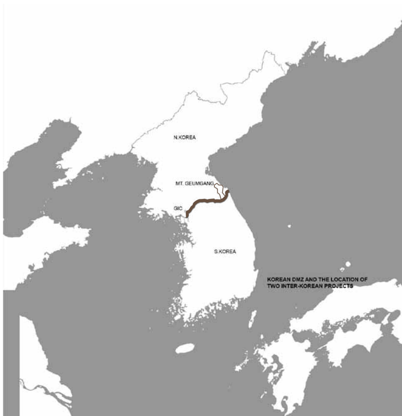
Figure 2. Location of DMZ and two inter-Korean Projects