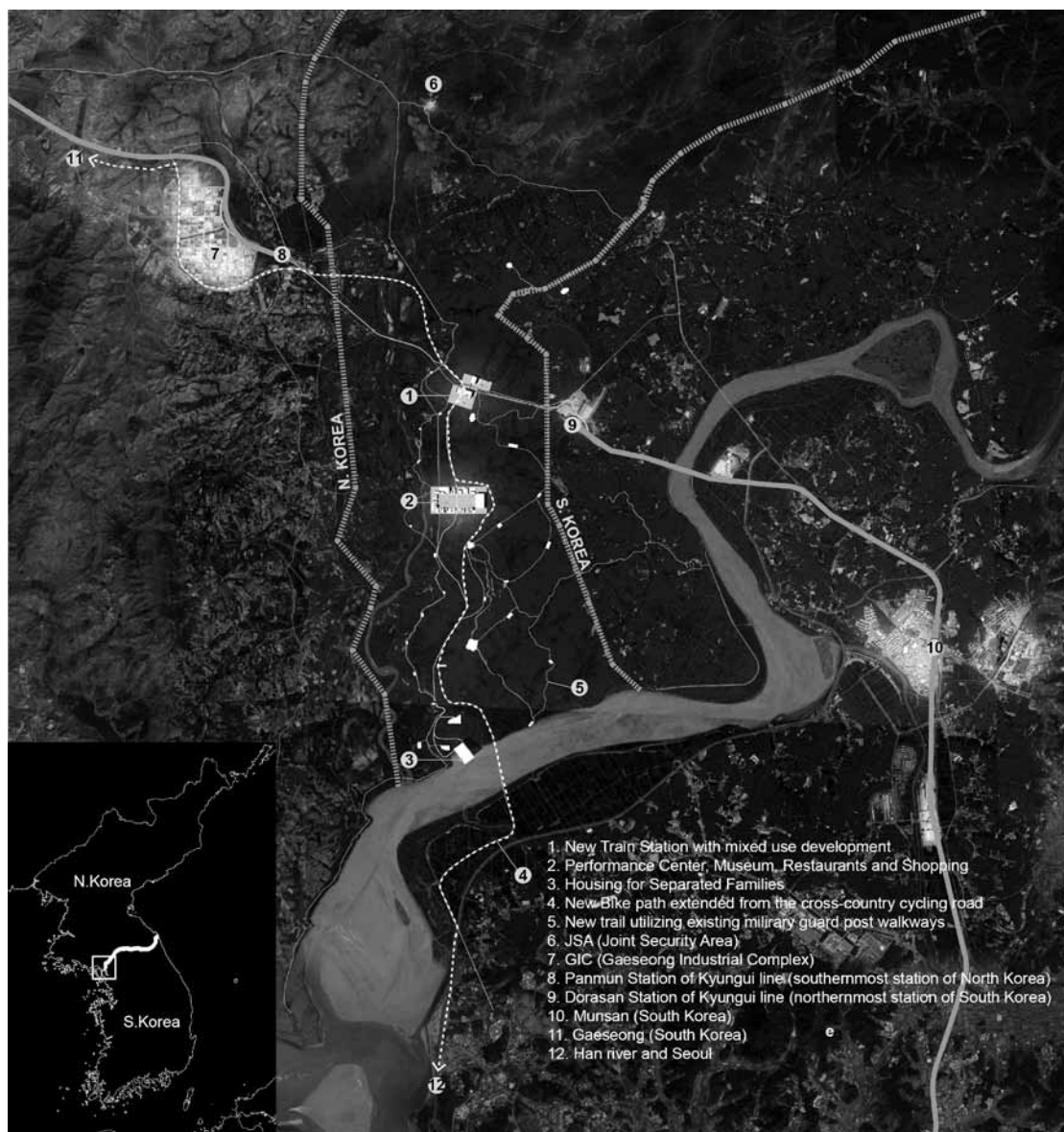
Figure 4. Suggested Location of the Shared Spaces between Two Koreas