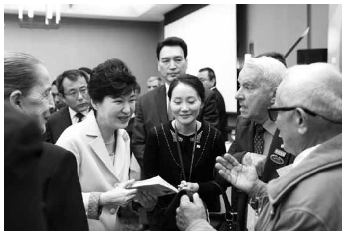
Figure 5. President Park in Colombia meeting Korean War veterans.