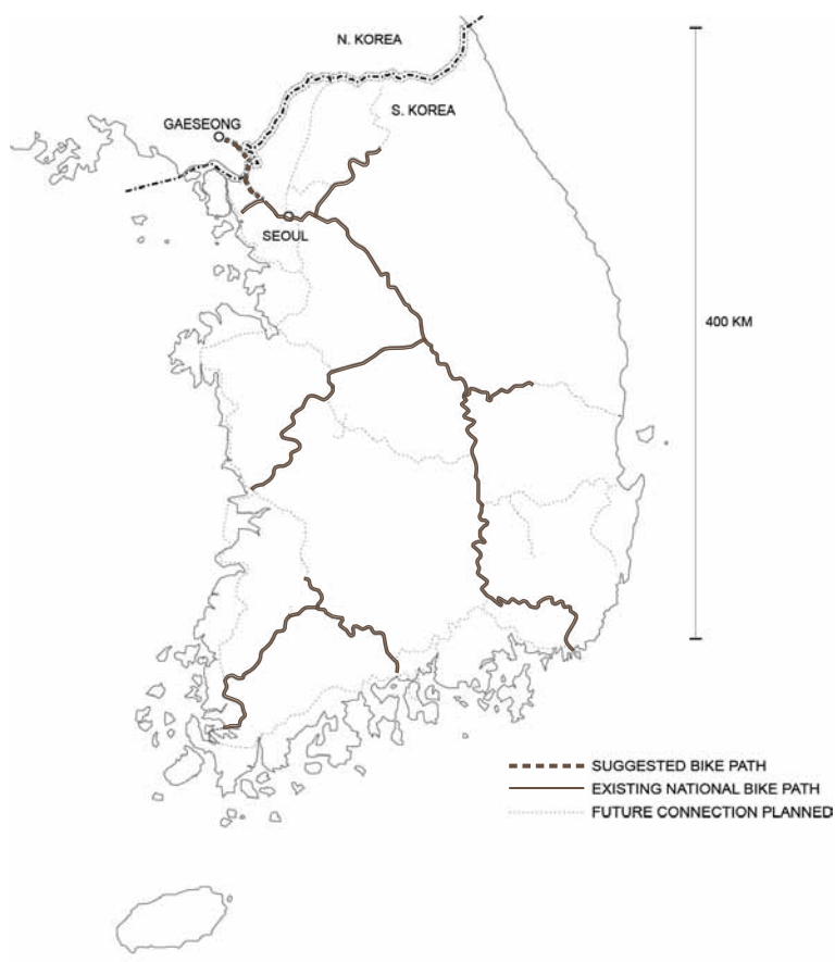
Figure 8. Extending the Bike Infrastructure to DMZ and North Korea

The planning and design strategy of the DMZ Cultural center suggests that spaces can be seen as an event, not merely as a physical place. Unexpected encounters, cultural events, and entertainment could take place along the conflict infrastructure. The use of public space to enhance interactions and create opportunities for the reciprocal respect of plural cultures is an important prerequisite for the reconciliation process. Therefore, the Korean crisis is a great opportunity to address the role of architecture and planning in developing socio-cultural capital. Tragic history