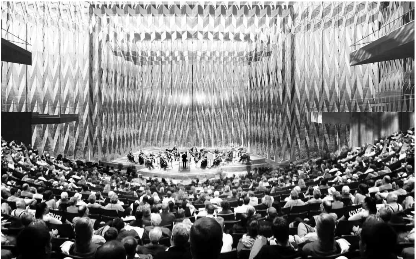
Figure 7. DMZ Cultural Center Performance Hall Rendering