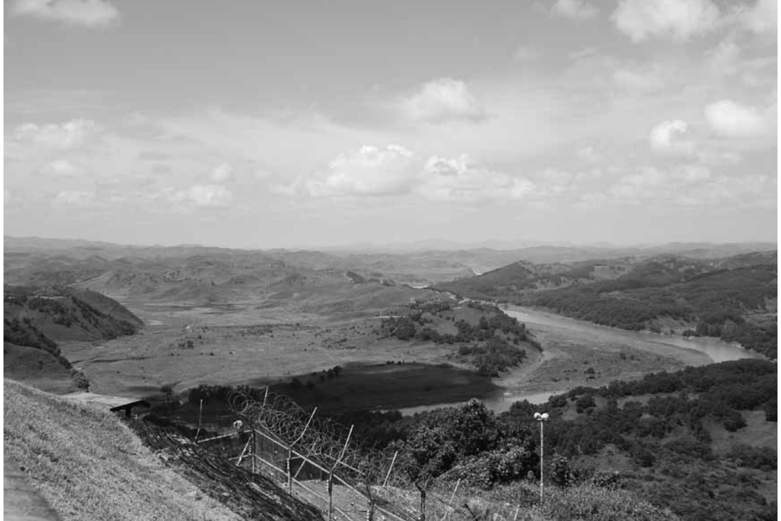
Figure 1. Demilitarized Zone.

obvious signs of conflict infrastructure. They were built as temporary barriers, but over the years they have become wider and higher. Research in 2012 reported that 78% of the general population believes that the segregation of communities is common, even in places where there are no Peace Walls, and it has been observed that the issue of both real and perceived segregation extends beyond the physicality of walls. 5 Ultimately, the conflict is manifested throughout citizen's everyday lives (69% of residents think that the Peace Walls are still necessary because of the potential for violence). This represents the reciprocal nature of the built environment as it shapes communities and individuals, providing effective memorials that shape their future, and exacerbate social, political, and economic conflict.